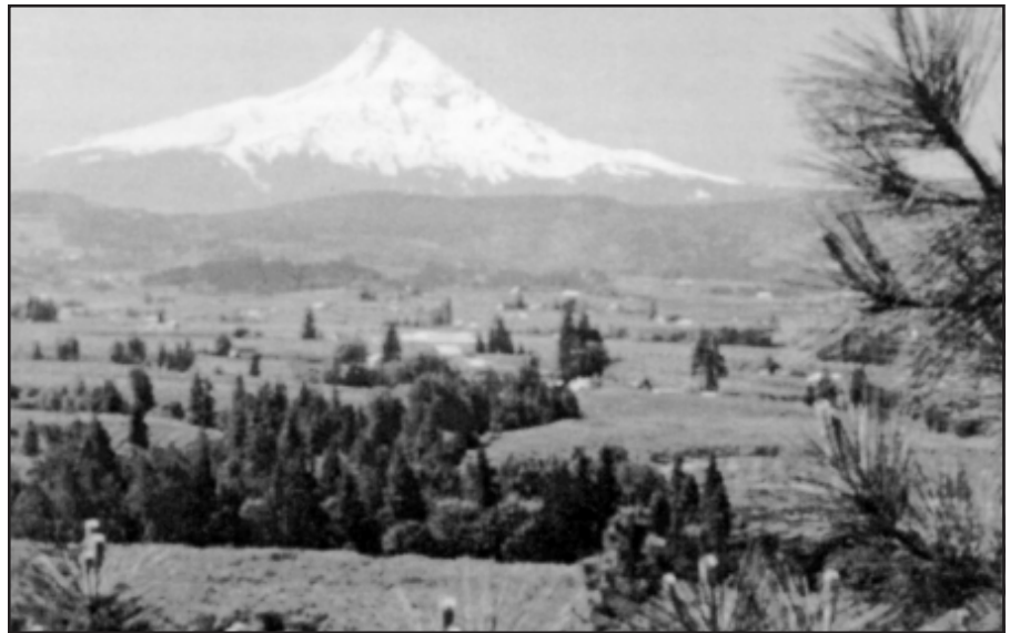
The Hood River Valley is a major pear-producing region of the Pacific Northwest. Climate and soil type vary from region to region and are only two of the many factors to consider when choosing pear rootstocks.

Rootstocks also vary in their tolerance of heavy soils and cold winter temperatures, their effect on tree vigor, and other factors. If a rootstock usually will be injured when the temperature falls slowly to -10°F, it's not considered cold-hardy enough for the mid-Columbia district and districts north of there. These same stocks may be injured at