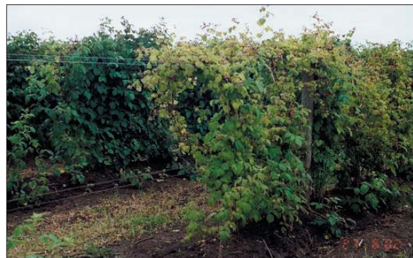
Figure 2.—Nitrogen-sufficient red raspberry (left) and nitrogen-deficient red raspberry (right).