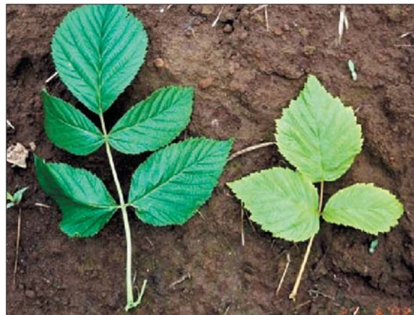
Figure 1.—Nitrogen-sufficient red raspberry (left) and nitrogen-deficient red raspberry (right).

Caneberry plants require chemical elements from air, water, and soil to ensure adequate vegetative growth and fruit production. When levels of these nutrients in the plant are low, growth and yield may be affected. Severely reduced nutrient supply can lead to visible nutrient deficiency symptoms such as leaf discoloration and distortion (Figures 1 and 2). Routine collection and analysis of tissue