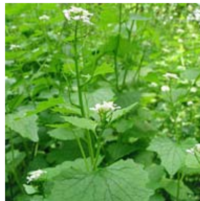
Figure 2 (far left).—Garlic mustard leaves.