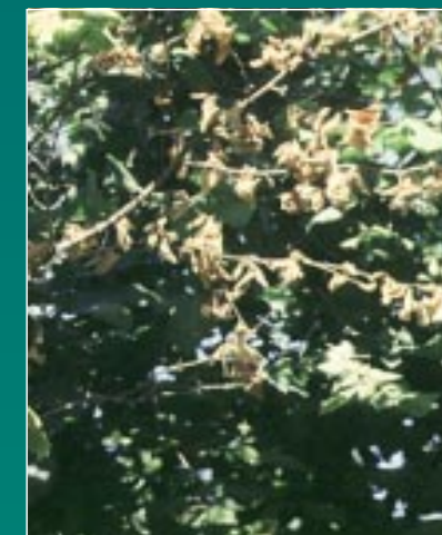
Figure 2.—In summer, it's easy to see dead leaves on infected branches.

Eastern filbert blight may be confused with Eutypella cerviculata , which produces smaller, black, fruiting bodies on dead branches. This fungus produces diagnostic black rings under the bark, which can be detected using a pocket knife. Cicada egg-laying scars also can look somewhat like EFB, but they are not black, and they look stitched.