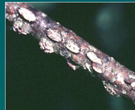
Figure 1.—The stroma forms in July and August.

Elongated, raised bumps begin to form on infected twigs and branches during June. When the bark is removed, the cambium below these bumps is chocolate brown.